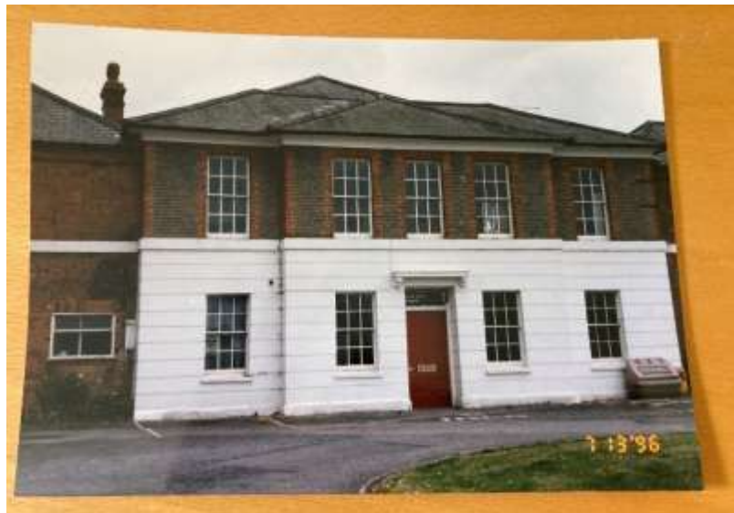
Sandleford Hospital in 1996, originally Newbury Workhouse